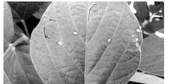
Frog Eye Leaf Spot in Soybeans Source: Mississippi State University Ext. Tom Allen, Extension Plant Pathologist July 12, 2014 11:23

Growing conditions favor development of leaf disease in East-Central, including Frog-Eye Leaf Spot. Look for spot lesions that progress from gray to brown to light tan in color surrounded by a narrow reddish-purple margin. A light green halo may also be present on some soybean varieties. A fungicide application can effectively control Frog-Eye Leaf Spot. Research suggests applications made during pod development (R3-R4) are the most effective to manage this pest. Contact your local Illini FS Crop Specialist for help to positively identify the disease and for fungicide treatment options.