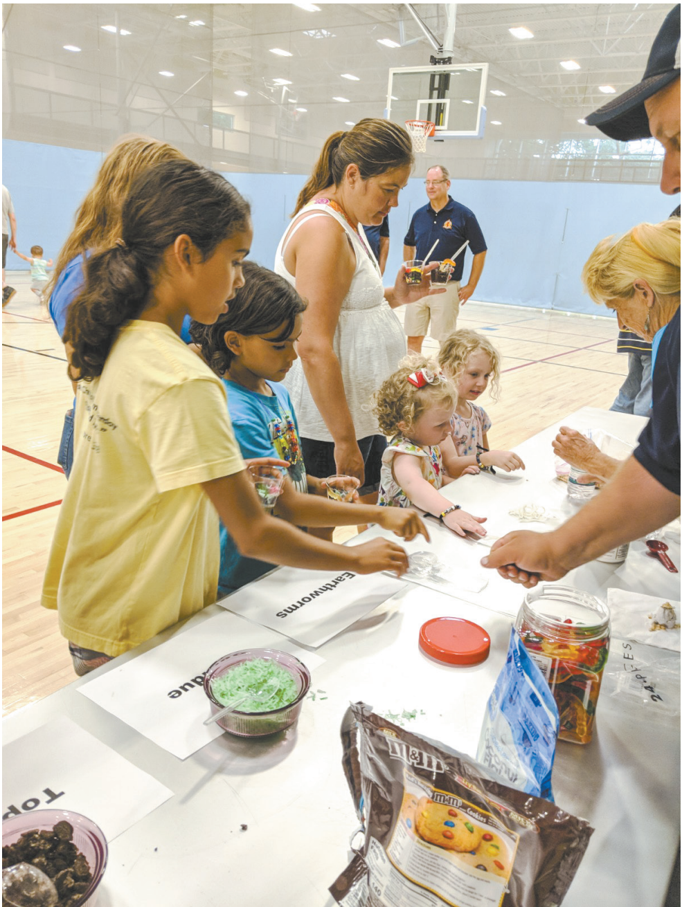
Over 100 children had a great time at Family Fun Night! The CCFB hosts this event in cooperation with the Champaign Park District with the goal of educating kids on where their food comes from. Thank you to all the volunteers that made this event possible!