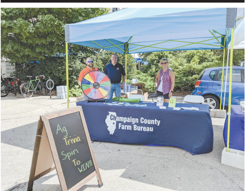
The CCFB had a great evening at the Champaign Farmer's Market. The Ag Trivia Game was a great conversation starter as over 100 people visited the booth. The CCFB will be back at the Farmer's Market on Aug. 21 from 3:30 to 6:30