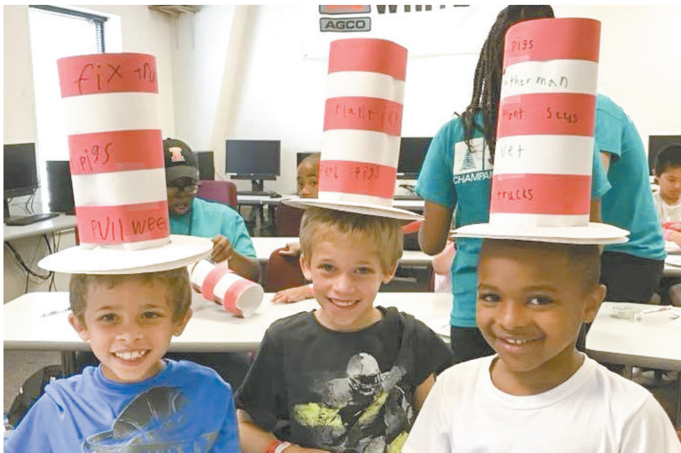
Three campers from the Champaign Park District's Leonhard Center pose for a photo after creating their own Dr. Seuss Hats.

While learning about the diverse careers in agriculture, each student made their own red and white striped hat, just like The Cat in the Hat would wear. Students wrote a career or activity on each stripe that was relevant to an agricultural career they are interested in.